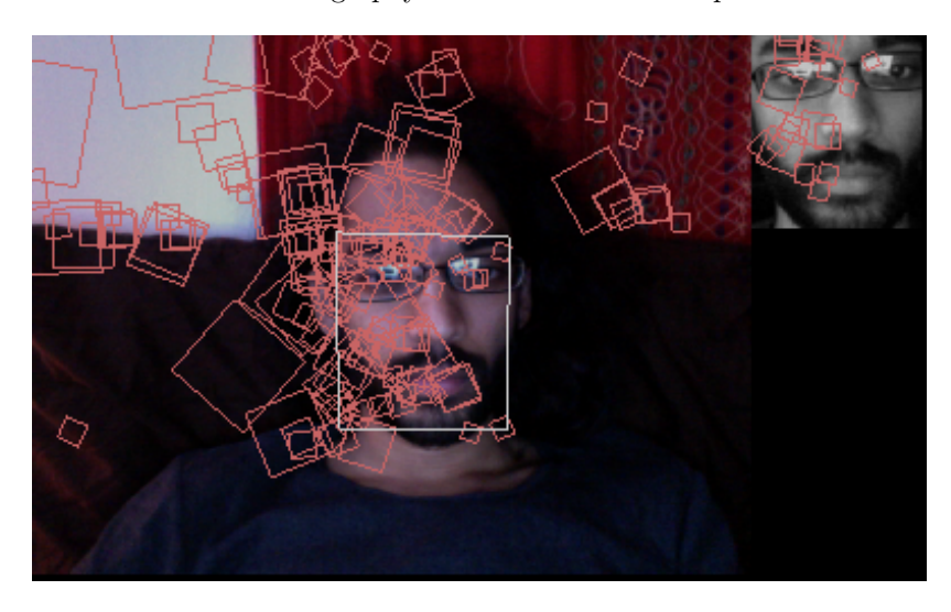
Figure 2: Detection of an object

Make sure you have downloaded the additional files required for this lab from the website. The zip file include a header and source file for a class called pkmImageFeatureDetector which wraps a lot of the functionality necessary for detecting features, describing them, approximately matching them, and describing a homography between them. Homographies are very useful concepts in Computer Vision that describe an affine transformation. We will use a homography in order to detect the position and rotation of an object.